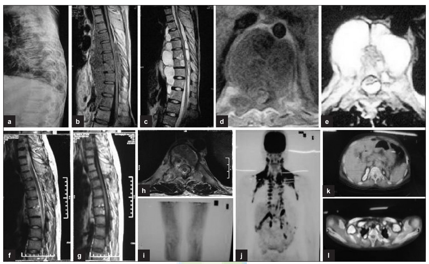
Figure 2: (a) Plain X-ray (pretreatment) lateral view shows reduction in disc space in D4, D5, D6, and in D9, D10, D11 with endplate erosions and fuzzy paradiscal margins. (b, c) Sagittal T1W and T2W (pretreatment) sections show paradiscal lesions with intraosseous caseation, preserved discs with discitis, anterior subligamentous spread of large prevertebral collection, anterior and posterior epidural spread of collection compressing the spinal cord. (d, e) Axial T1W and T2W sections show septate prevertebral collection, intraosseous caseation with large anterior and posterior epidural collections, and 80% canal encroachment. (f, g) Sagittal T1W and T2W (post-treatment) sections show patchy replacement of marrow by fat seen as bright T1 signal with near-complete resolution of collections and marrow edema. (j, k, l) Coronal and axial sections of PET scan show no FDG uptake in vertebral column at 18 months, suggestive of complete healing