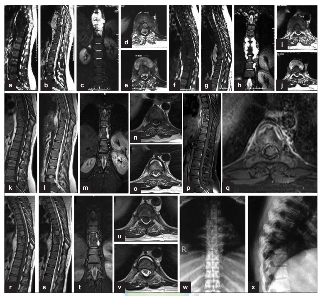
Figure 4: (a, b) Sagittal T1W and T2W (preoperative) sections show paradiscal lesions with intraosseous caseation, preserved discs with discitis, anterior subligamentous spread of large prevertebral collection, anterior epidural spread of collection compressing the spinal cord. (c) Coronal T2W section shows large paravertebal collection. (d, e) Axial T1W and T2W sections show septate prevertebral collection, intraosseous caseation with large anterior epidural collections, and 80% canal encroachment. (f, g) Sagittal T1W and T2W (4-month post-op) sections show persistent collections and further destruction of D7, D8, and D9 vertebrae. (h) Coronal T2W section shows persistent large paravertebal collection. (i, j) Axial T1W and T2W sections show persistent septate loculated collections and anterior epidural extension. (k, l, m, n, o) MR sagittal, coronal, and axial (at 9 months of second line ATT) sections show significant resolution of collections with persistence of a thin rim of prevertebral collections with rim of paravertebral abscess. (r, s, t, u, v) MR sagittal, coronal, and axial (at 14 months of second line ATT) sections show significant resolution of collections with patchy replacement of bone marrow by fat in D8, D9 vertebrae. A thin rim of anterior prevertebral collection is seen. (w, x) Plain X-ray AP and lateral views (at 18 months of second-line ATT) show sharpening and sclerosis of paradiscal margins with no significant paravertebral shadows suggestive of healing

contradictory, then either the results of the better laboratory should be relied on or the result with the worst case scenario should be entertained.<sup>8</sup> The tissue should also be sent for PCR and histology to reduce the risk of false diagnosis in case the culture and sensitivity does not show growth of the bacteria.