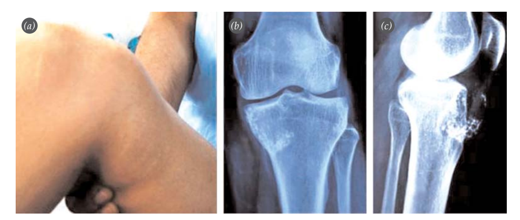
Fig. 1. (a) Clinical photograph of the knee showing infrapatellar swelling. (b) Anteroposterior and lateral radiographs of the knee showing scalloping of tibia with spotted calcification. [Color figure can be viewed in the online issue, which is available at www.aott.org.tr]

Extraskeletal chondromas are rare, benign cartilaginous tumors, known to occur due to metaplasia of the mesenchymal cells in the capsule or adjacent connective tissue of a joint.<sup>[1,4,6]</sup> Cartilage prolifera-